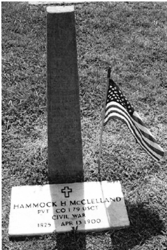
Hammock McClelland; Star Cemetery, Shreveport