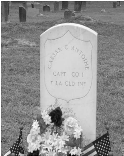
When it was New